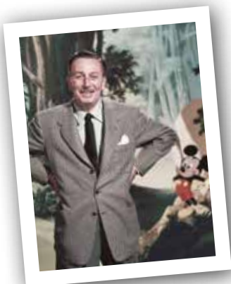
7 Walt Disney