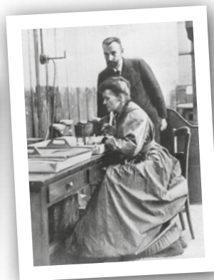
5 Marie and Pierre Curie