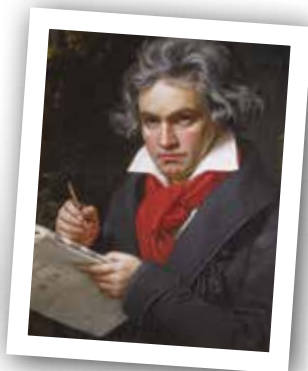
6 Ludwig van Beethoven