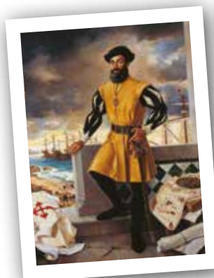
1 Ferdinand Magellan