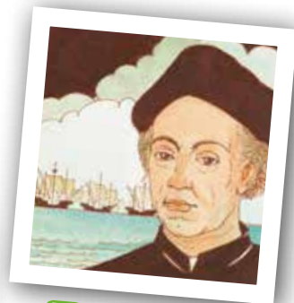
3 Christopher Columbus