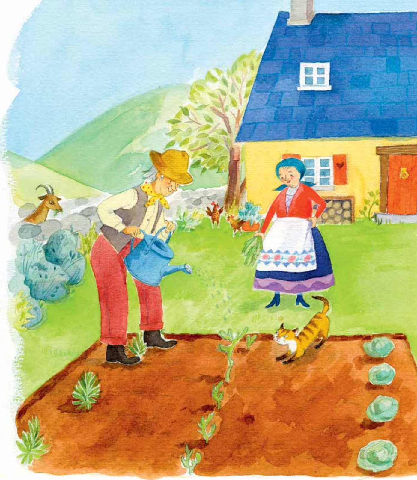
The seed grows. The man's happy.